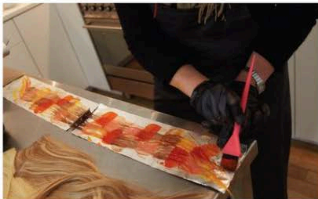
HairUWear Professional clip-in extensions are hand-painted.