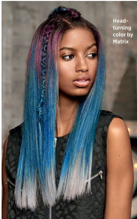
Head-turning color by Matrix