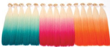
Great Lengths Custom Color Ombre