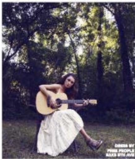
SALES 8TH AVE