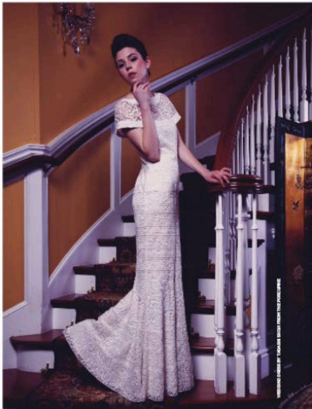
WEDDING DRESSES BY TIGERLIL DESIGN FROM THE PORCUPINE