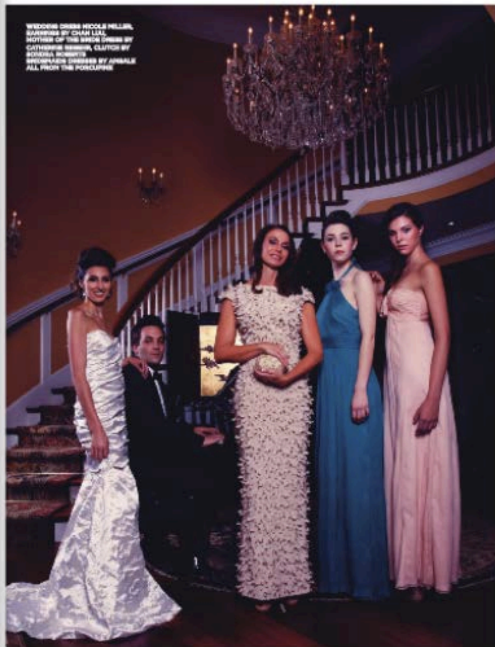
WEDDING DRESS NICOLE MILLER, BARRINGA BY CHAN LILL, MOTHER OF THE BRIDE DRESS BY CATHERINE BERRON, CLUTCH BY BOHEMIA MONASTIS BROOMMAID DRESSES BY ANNALE ALL FROM THE PORCUPINE